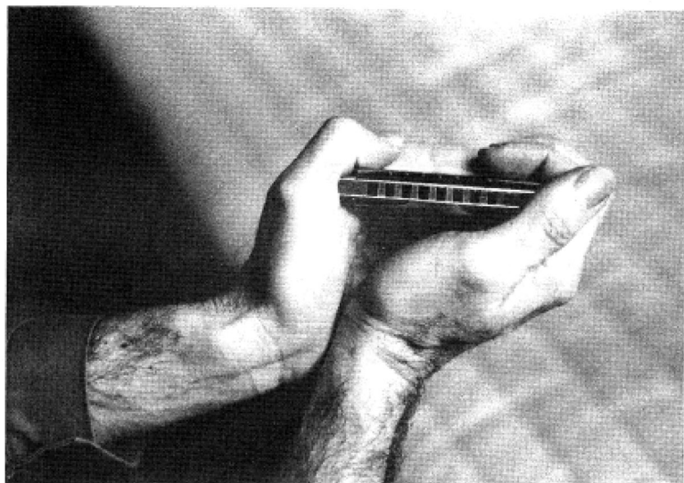
JOHN'S HAND POSITION